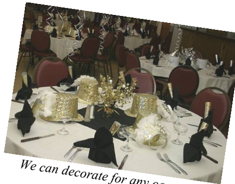
We can decorate for any occasion!