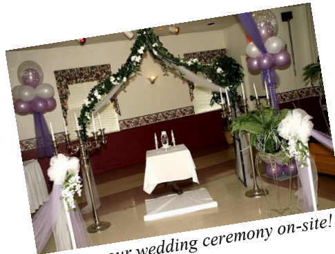
Have your wedding ceremony on-site!