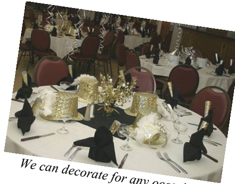
We can decorate for any occasion!